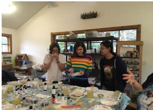
In celebration of Epiphany, Fire on the Mountain youth created unique scent combinations at Full Circle

In the same way, let your light shine before others, so that they may see your good works and give glory to your Father in heaven.