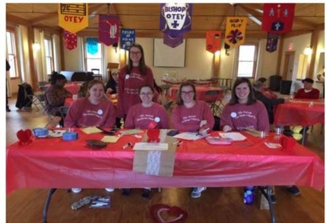
Sewanee Hearts and Grocery Carts