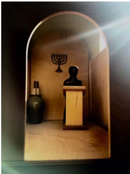
On the first day of Advent, the light of early afternoon filled the little temple in the Godly Play room.