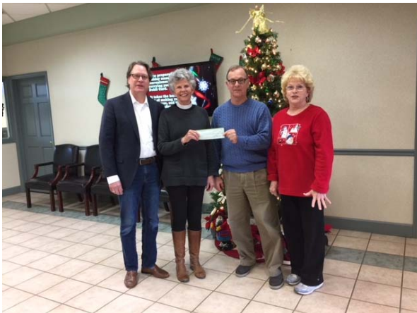
Many thanks to Sewanee Business Alliance and Mountain Valley Bank for sending funds from the Reverse Raffle to CAC .