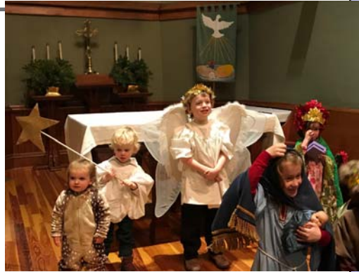
More Pageant Pictures

Otey offices and the CAC will be closed on January 1 and January 15..