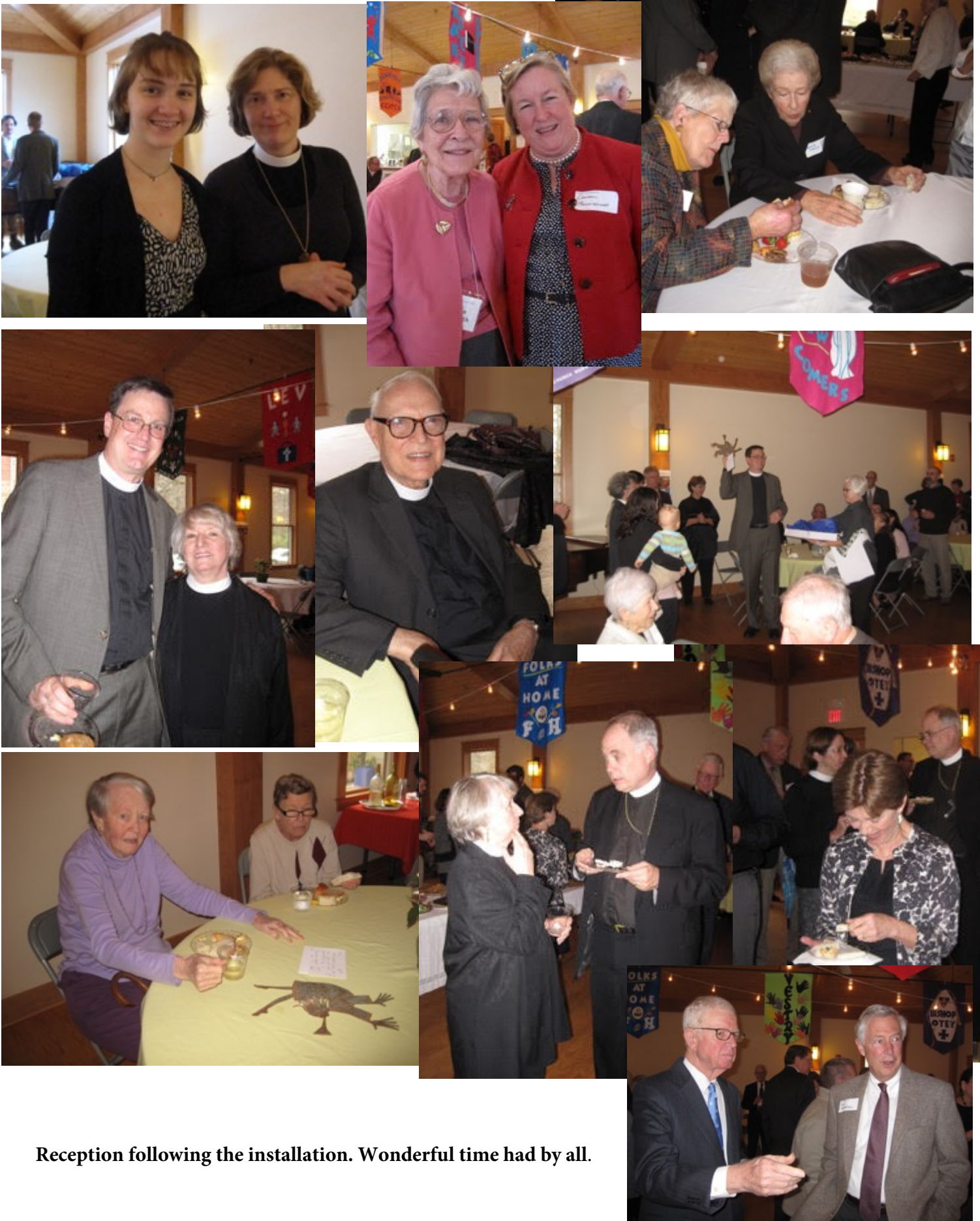
Reception following the installation. Wonderful time had by all.