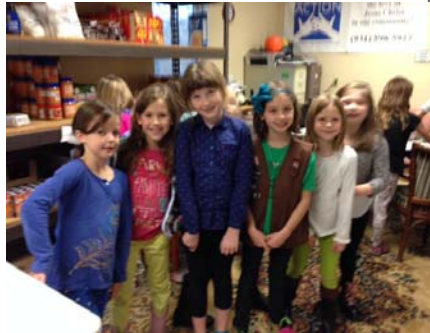
Girl Scouts helped pack groceries for CAC.

Looking for a gift for your friends or family who have everything? How about a gift in their honor to CAC,. It truly is the gift that keeps on giving!